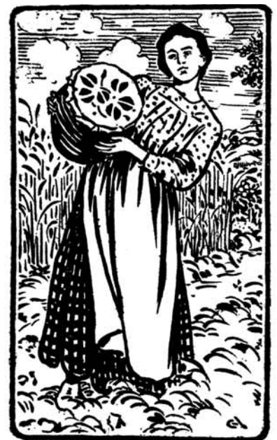
Graphic Design ■ Normand Design