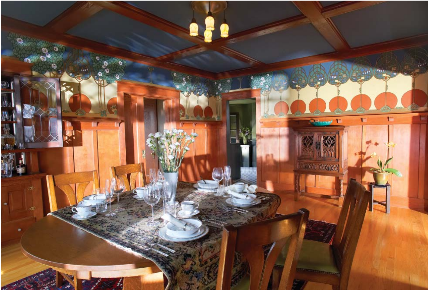
Dining room mural and interior design by CJ Hurley Century Arts Studio.